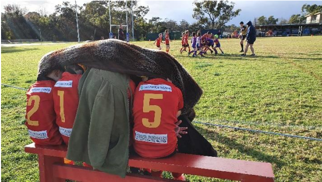
Getting together as a team and missing Winter already

We touched on this after the lockdown last year, however I cannot stress it enough – The men are growing up in the most unusual and trying of times – Rather than us feel sad for them though, we should try to band together and strive to make things normal as possible. I am proud to report that we did this most of the time, to the best of our ability.