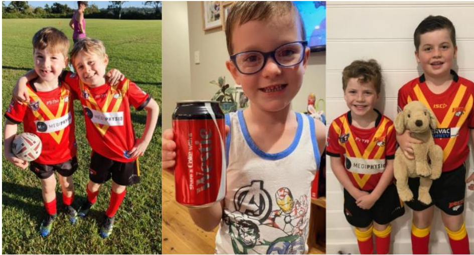
THE NEW RECRUITS: The best of mates, the master embracing his new nickname, and the brothers who prove once and for all "Tough Guys Carry Teddies"

One thing which makes ending the year so abruptly so hard, is that Under 6's and Under 7's are the two years when football is really just all about having fun. From next year, the men will start to want to keep score, develop competitive streaks, and as they get a bit bigger, they will start working harder. I for one will always be a little bit saddened that they didn't get the time that other generations coming through have had to experience the sheer joy of just getting to get together and throw the ball around, not competing and just playing Rugby League for the sake of playing Rugby League.